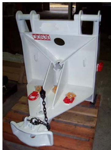
ODS Attachment Coupling

Scope of work for couplings and drawbars can include: