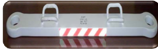
Shuttle Car Drawbar

All couplings and drawbars are manufactured and repaired to AS3751 and are issued with a NATA endorsed Test Certificate.