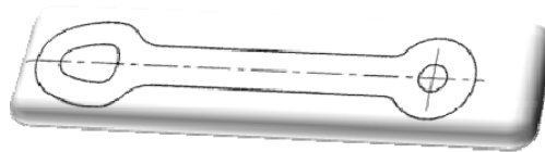
Male Pivoting Drawbar