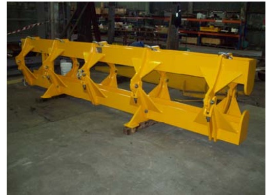
Cheese Weight Lifting Device

Our Mechanical Engineer has a membership with Engineers Australia