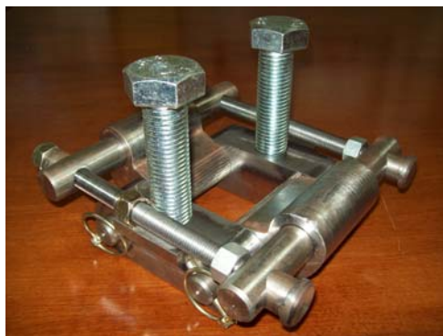
Wedge Extractor Unit

We are accredited with SAI Global as a Quality Endorsed Company to ISO9001.