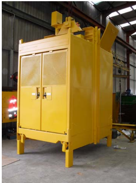
Man Cage for vertical shaft

We are accredited with SAI Global as a Quality Endorsed Company to ISO9001.