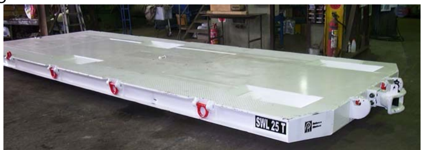
Flat Top Rail Car