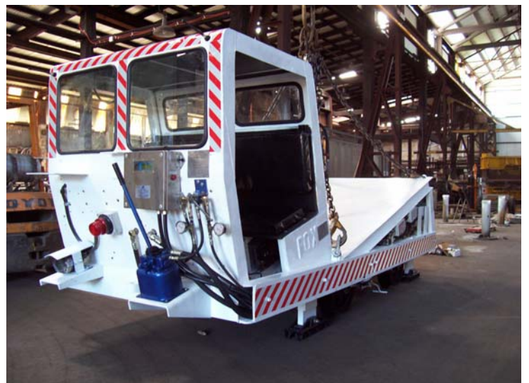
Belt Drift Dolly Car