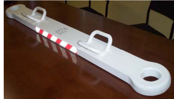
Shuttle Car Drawbar