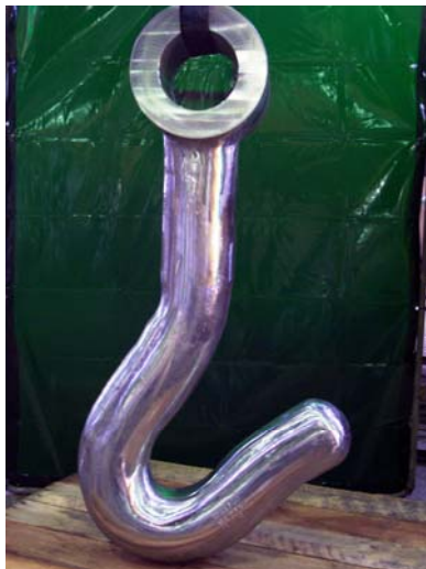
27T Forged Hook