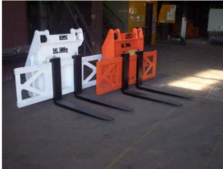
QDS Fork Attachment