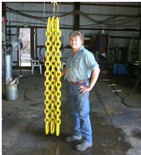
Butt Welded Safety Chains

P.O. Box 489 Mayfield 2304 100 Old Maitland Rd Hexham 2322 Tel: 02-49648500 Fax: 02-49648152